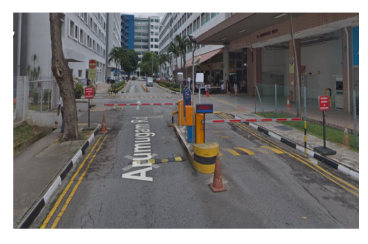
B. Walk towards the gantry.