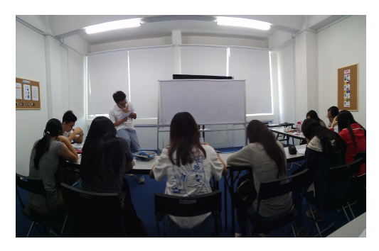
D. Proceed to learning centre for registration / optional placement test.