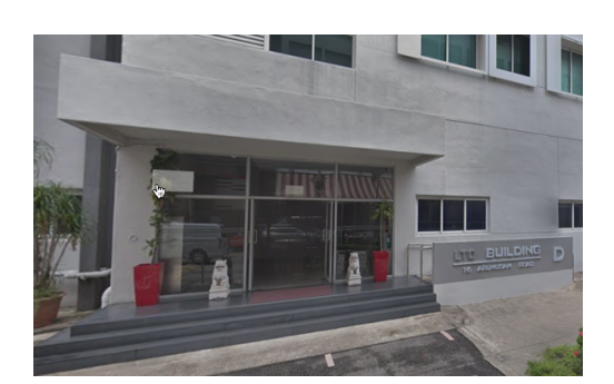
C. LTC Building D is just behind the gantry.