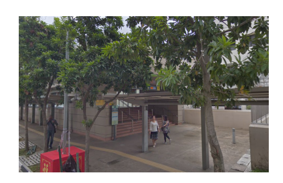
A. Exit from Macpherson Exit B.